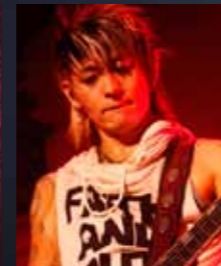
K.A.Z (VAMPS/OBLIVION DUST)