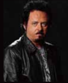
Steve Lukather (TOTO)