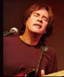
Carl Verheyen (Supertramp)