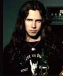
Gus G. (Ozzy Osbourne)