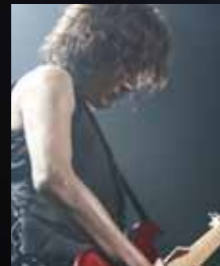
ken (SONS OF ALL PUSSYS/L'Arc~en~Ciel)