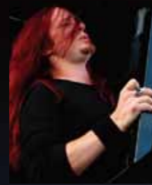
Michael Amott (Arch Enemy)